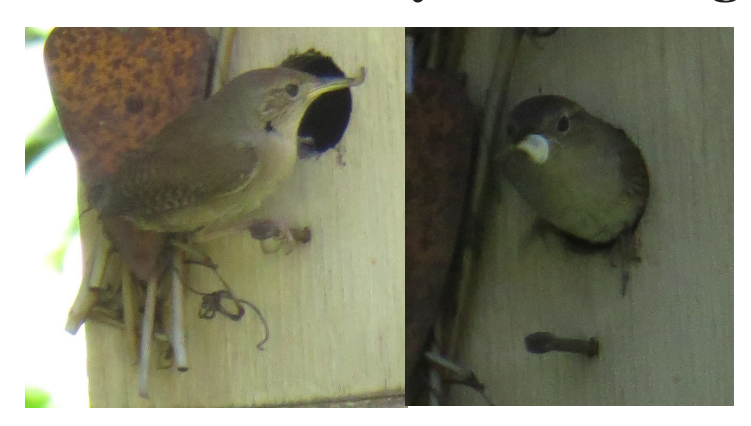
House Wren entering a neighbor's nest box (left) and removing a fecal sac from the nest box (right).

lucky and they even stayed in that spot long enough for me to run back inside and grab my camera!