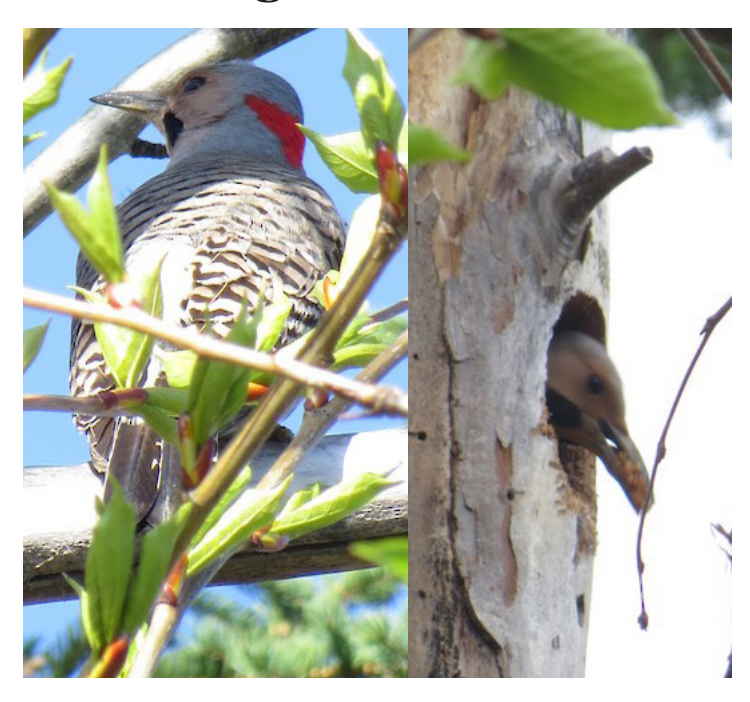
Male Northern Flicker excavating the cavity. Several times I saw the female poke her head into the cavity and then leave. A few minutes later, I would see the male return and start excavating some more. I imagined that she kept telling him that it still wasn't good enough!

On another day, I walked over to help my neighbor by bringing in his mail, and I observed a Chipping Sparrow carrying some food, so I stopped and watched where it went