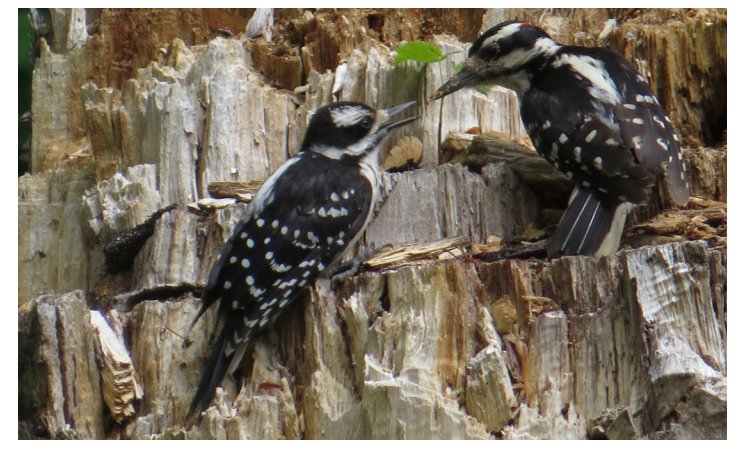
Adult Male Hairy Woodpecker feeding one of his fledglings. Fledgling birds will be fed by the adults for several weeks after they leave the nest.

A few days ago, I was taking my dog out to the back yard and happened to see two woodpeckers fly into a tree near my door. It being unusual to see two of them together like that, I decided to watch them for a while and see what was going on. They flew over to my neighbor's yard and I ran in to get my binoculars. Sure enough, it turned out to be an adult male Hairy Woodpecker who was being followed by a fledgling and I watched him feed it several times. I was