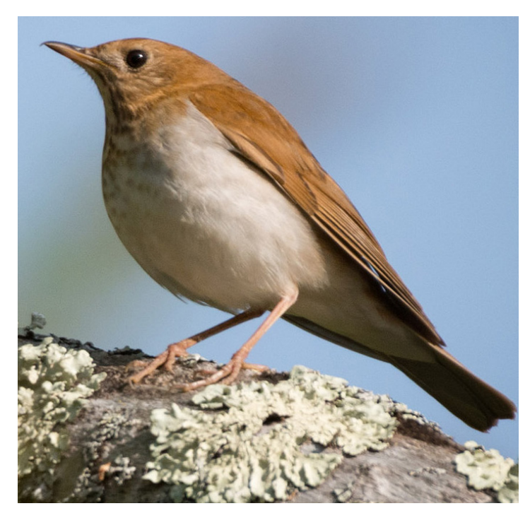
Veery, often heard during dusk.

The period around the setting sun and rising moon can be a captivating time to observe nature. While the ocular senses