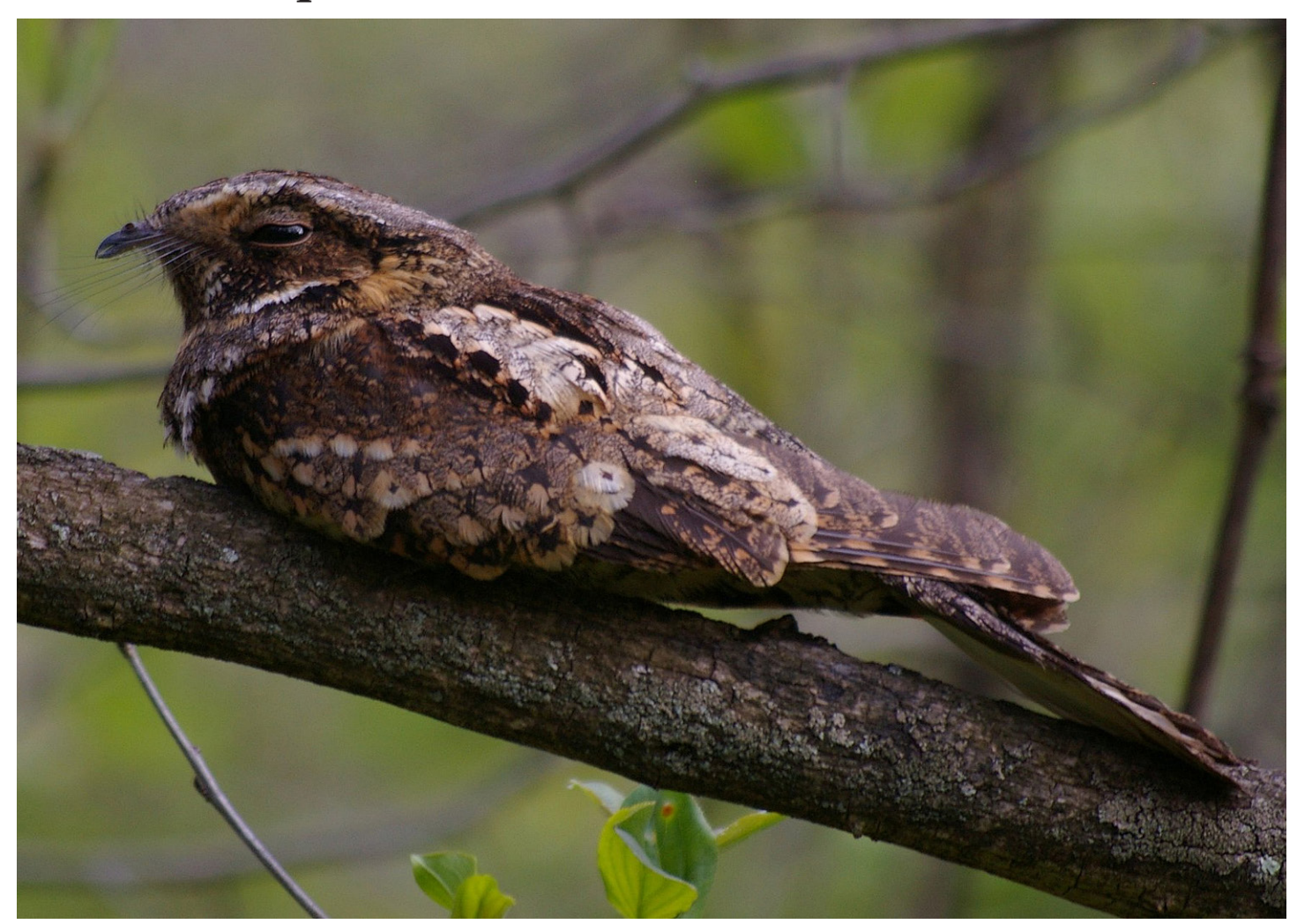
Eastern Whip-poor-will, with their nocturnal voices described as "liquid silver".

garbled-sounding song with maybe one or two "teachers" thrown in just so you were sure who was responsible. Some points were devoid of birdsong, but rich with the calls of Spring Peepers, Wood Frogs, and American Toads in May and Gray Tree Frogs, Green Frogs, and American Bullfrogs in June. Lately fireflies have teamed along the roadsides and hung over the wetlands like will-o-the-wisps while the occasional Luna Moth floats by, illuminated by the moonlight. These sights and sounds make it hard to ever feel disappointed, even if you don't hear any birds.