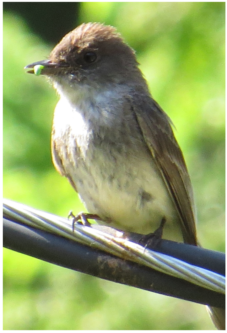
Eastern Phoebe carrying food to feed nestlings.